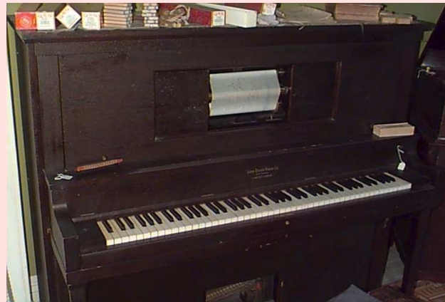
The Player Piano