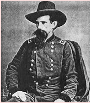
Ben Hur (1907)